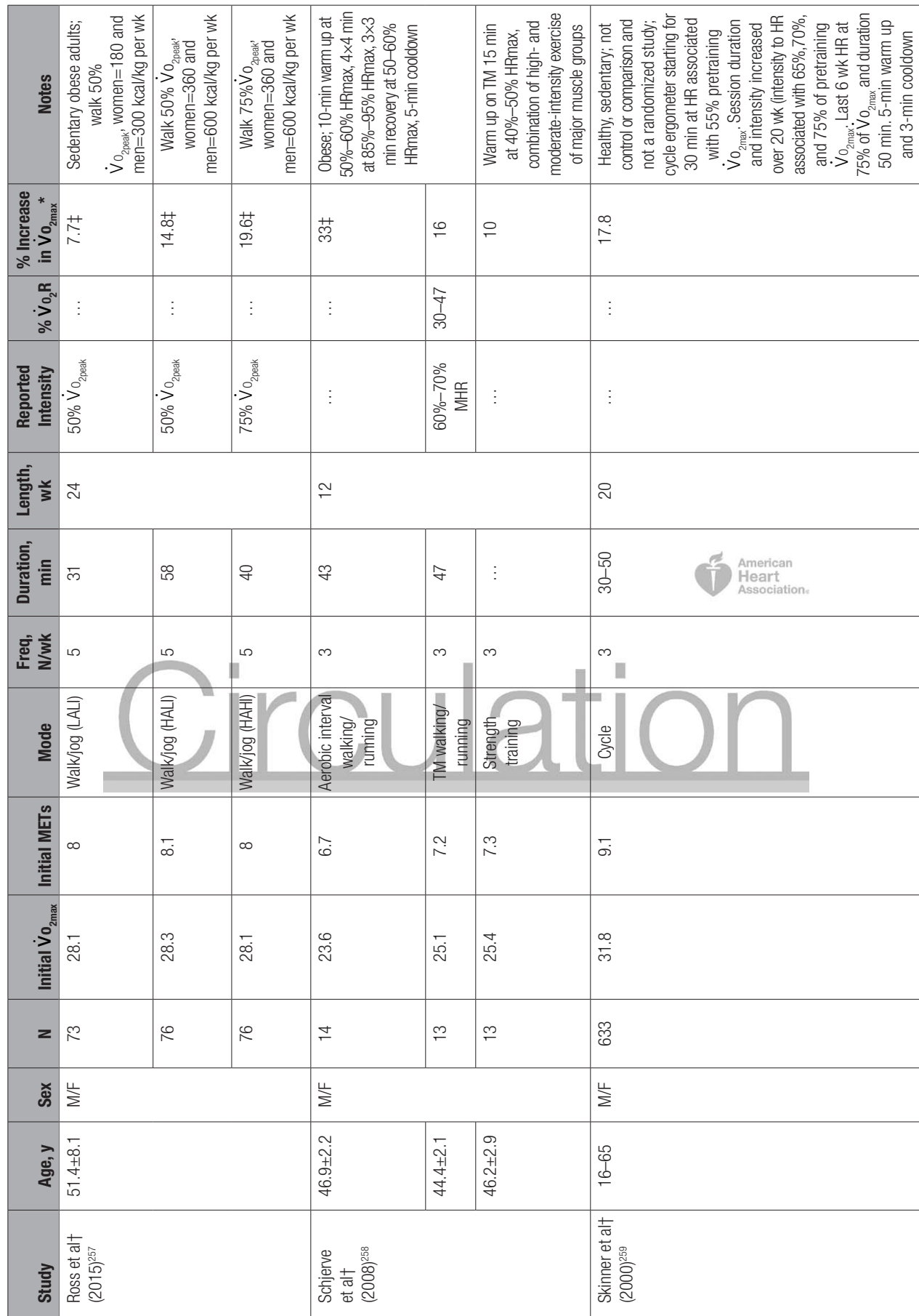
Table 7. Continued