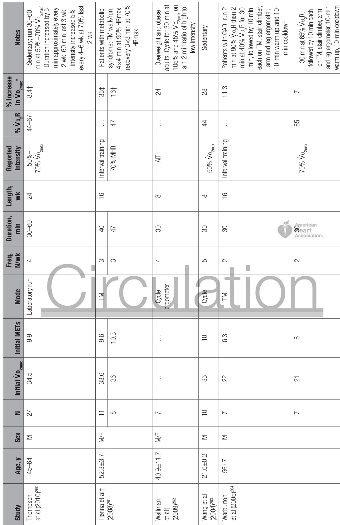
Table 7. Continued